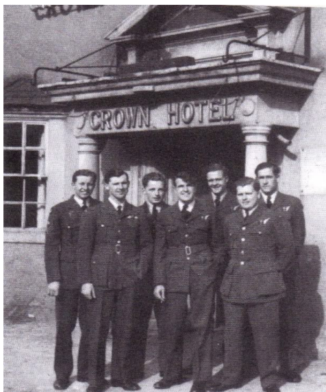
Air crew outside the Crown Hotel April 1944