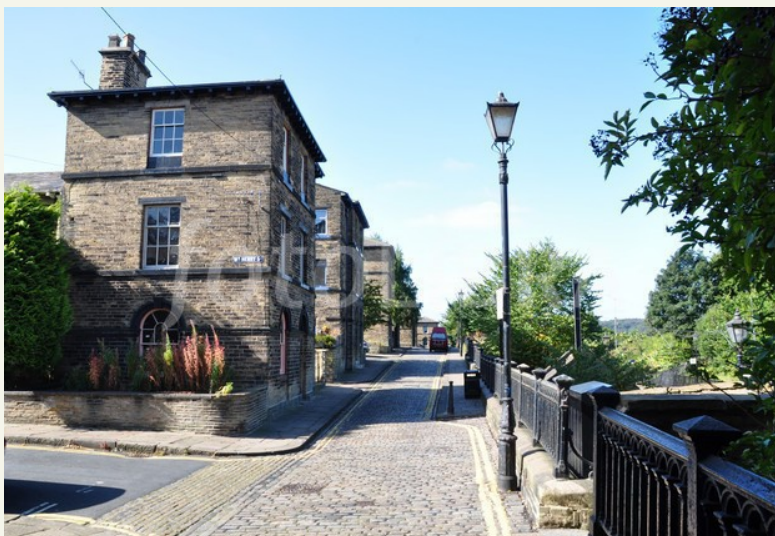
Lodgings Houses for men without families