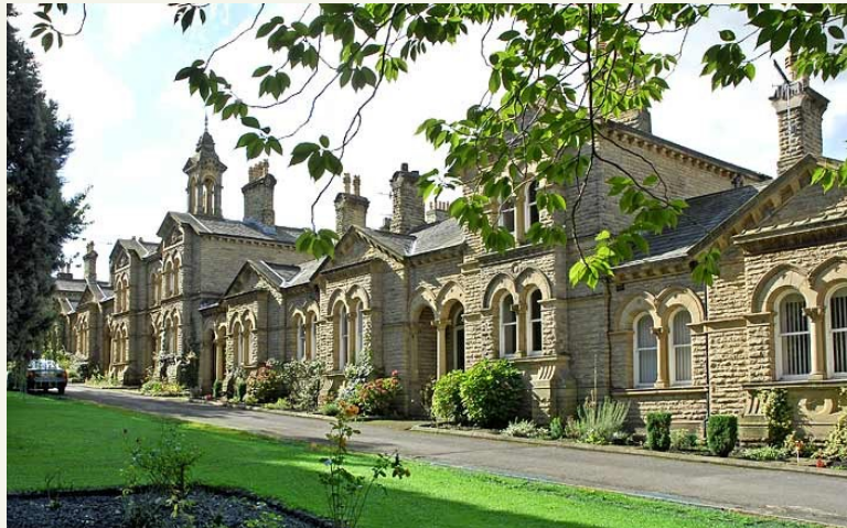
Almshouses for retired mill workers