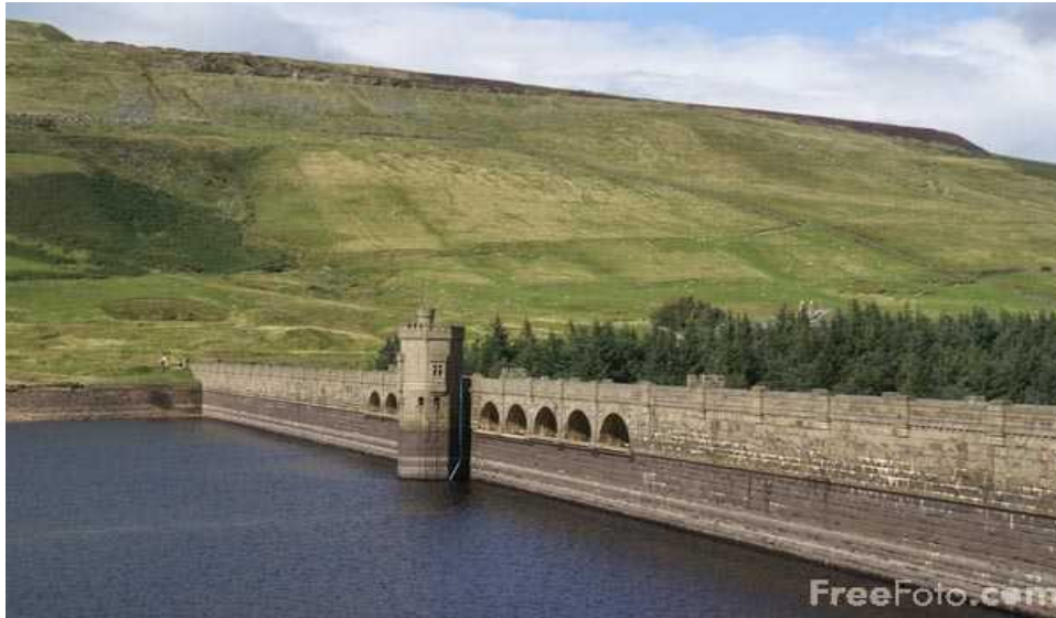
Scar House Reservoir