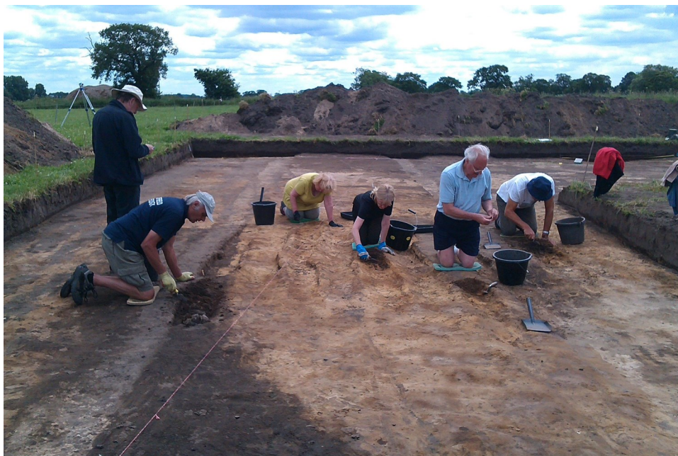
North Duffield Excavation