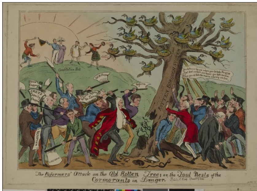
Boroughbridge was one of many rotten boroughs political reformers complained about

A formal proposal will be made at the AGM in September to adopt this topic as the next project for the Society, with the aim of getting this fascinating aspect of our local history collated, recorded and published for future posterity. I will also give a talk on what I have uncovered so far at the meeting.