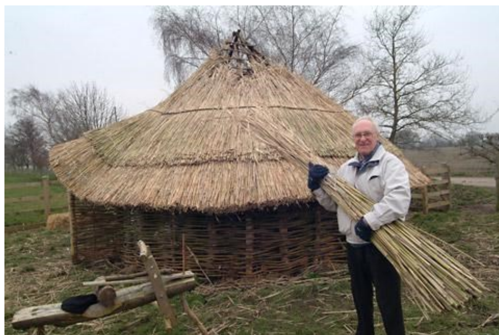
Recreated Round House