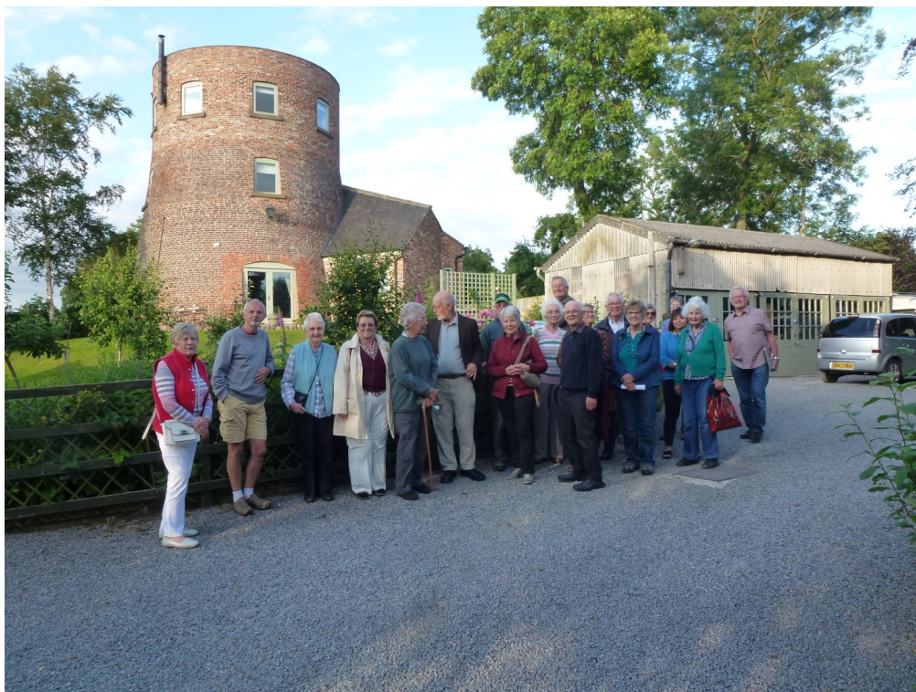
Society members and hosts outside the rebuilt windmill