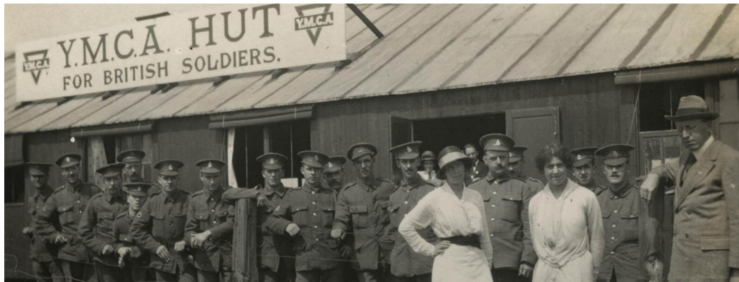
YMCA hut (above) and fund raising campaign image (below)