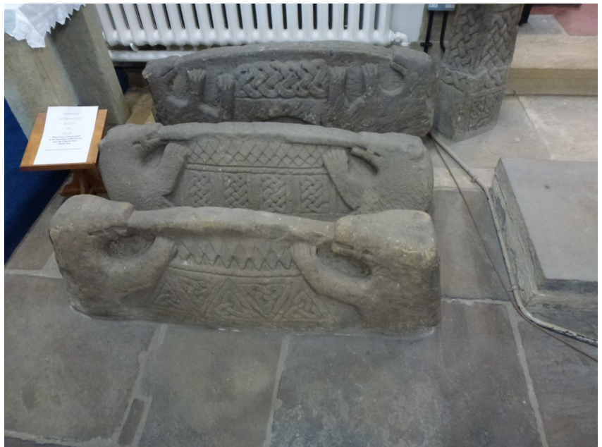
Hogback sculptures displayed in the church

St Thomas' Church on High Green is a Grade I listed building dating from the 12th century with additions in the 14th and 15th centuries and a restoration undertaken in 1868. It has a collection of Hogback sculptures. This collection together with Viking period crosses suggest Brompton was the base for a company of stone carvers during that period.