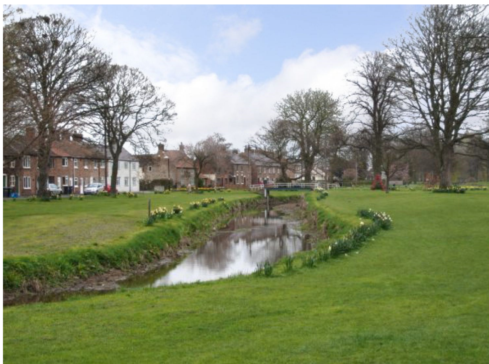
Village green and weavers' cottages